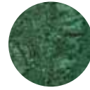
GUATEMALA GREEN Polished