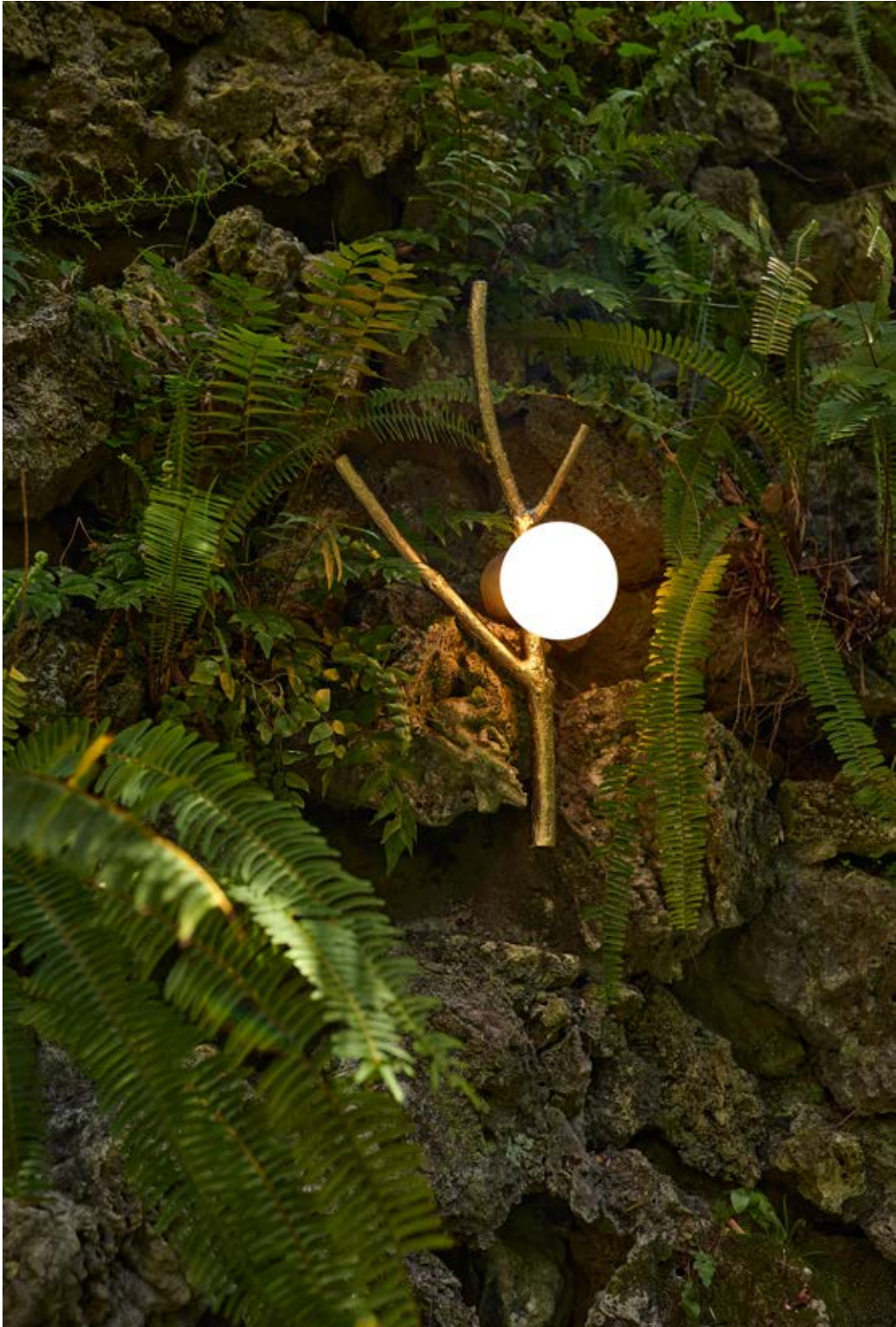
Medronho Wall Lamp