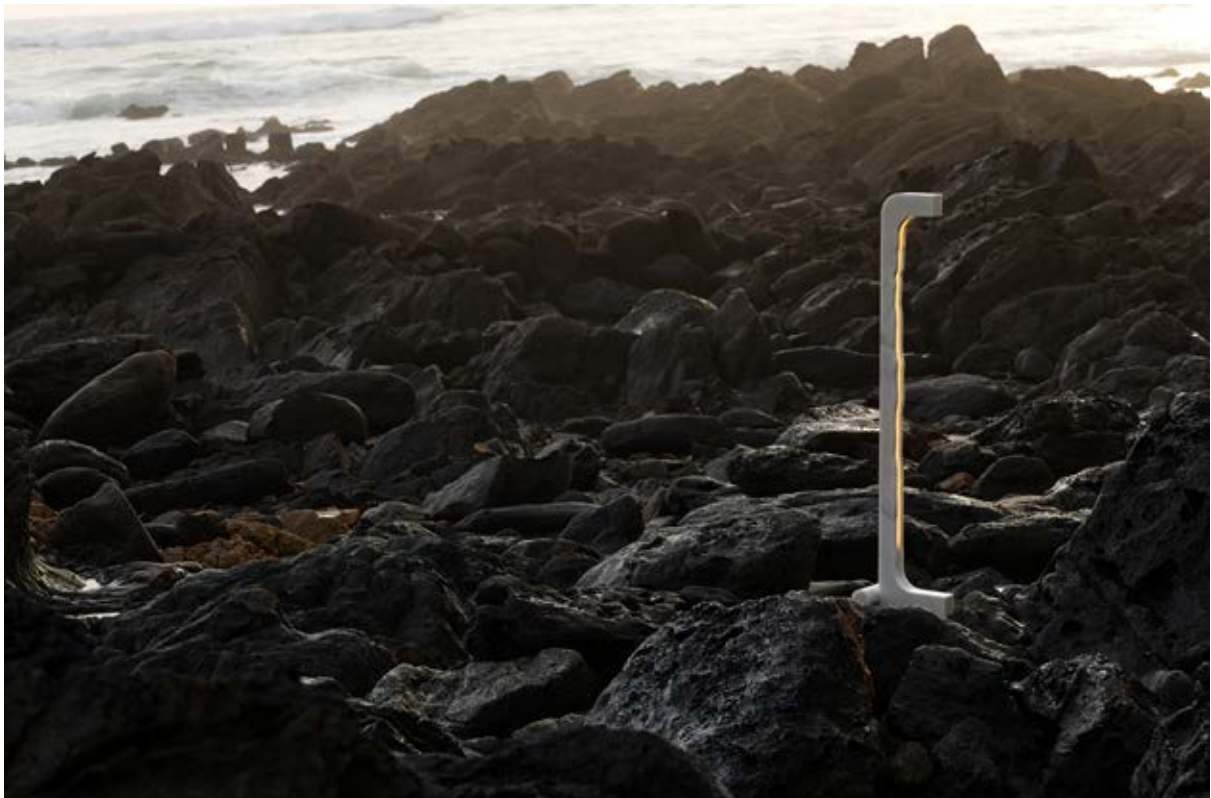
Etna Floor Lamp

The Dolmen 88 bookcase explores the relationship between architecture and sculpture through solid volumes and open spaces, while the Flora 94 bookcase establishes a delicate dialogue between transparency, texture, and materiality through the combination of cast brass and smoked glass.