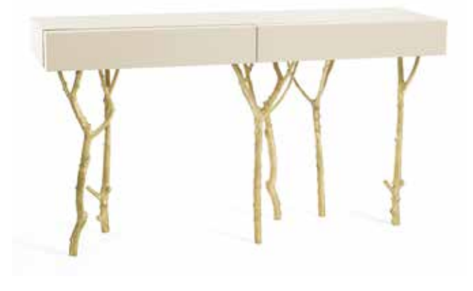
Fig Tree | Console

The Fig Tree Console is a tribute to Nature's graciousness. The legs are made from fig tree branches in brass casting mold. The lacquered top has two drawers with purpleheart wood veneer lined with a subtle metal rim.