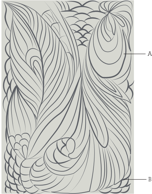
COLOURS BY AREA (AS PER OUR DESIGN)